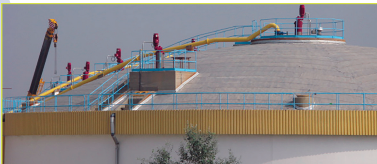
Digestion tank (with several agitators) - Baraki - Algeria