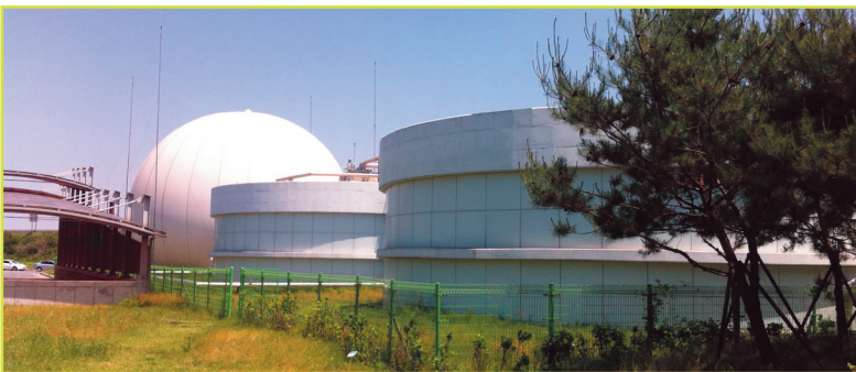
Installation for methanization of waste water plant sludge